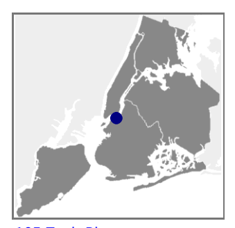
105 Tech Place Brooklyn NY 11201

Theater / Play Production, Playwriting, Graphic Design