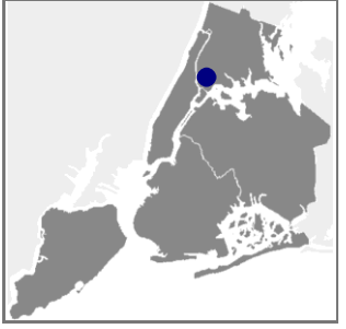
455 Southern Blvd Bronx NY 10455

Core Music, Mixed Media, Studio Art, Modern Dance, Graphic Design